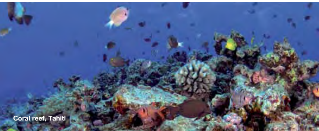
Coral reef, Tahiti