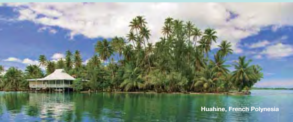
Huahine, French Polynesia

All air, cruise, and land accommodations, local transportation, and optional shore excursions are arranged by Oceania Cruises, who may use other suppliers or providers to render the services. The agreement in this brochure is the exclusive and entire statement of the agreement between you and Go Next, Inc. It should be read carefully.