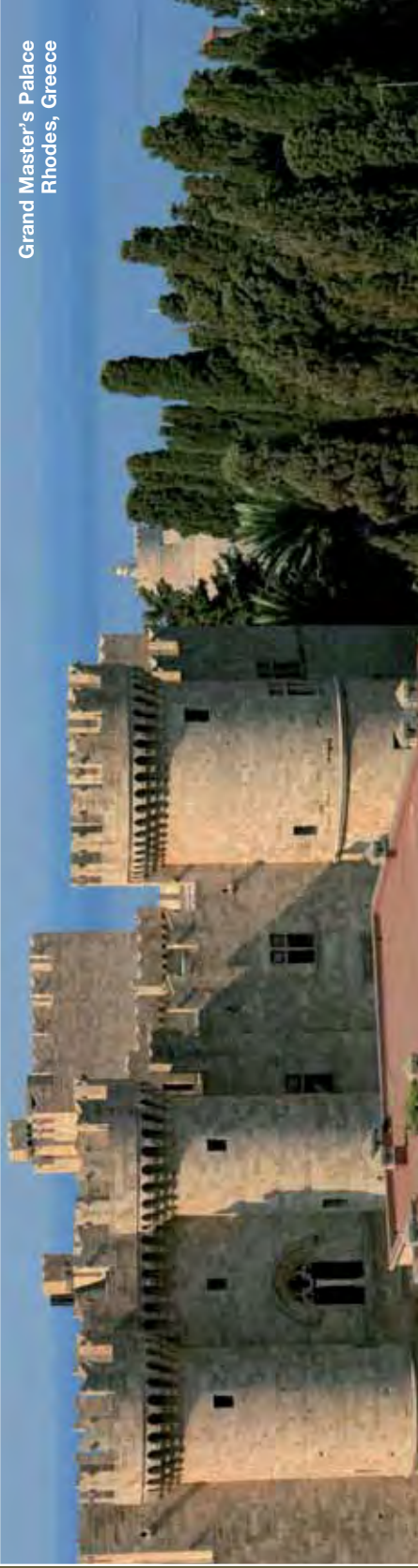
Grand Master's Palace Rhodes, Greece